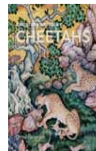
The Story of India's Cheetahs By Divyabhanusinh; Marg Books; 324 pages; Rs 2,800

The author also addresses the recent controversy surrounding the translocation of cheetahs from Africa to India. He argues that African cheetahs have been imported into India since the early 20th century, primarily due to the