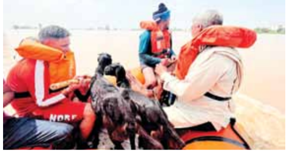
National Disaster Response Force (NDRF) personnel rescue villagers from a flood-affected area as the swollen Beas river inundated nearby areas following heavy monsoon rains, near Ferozepur district of Punjab on Friday.