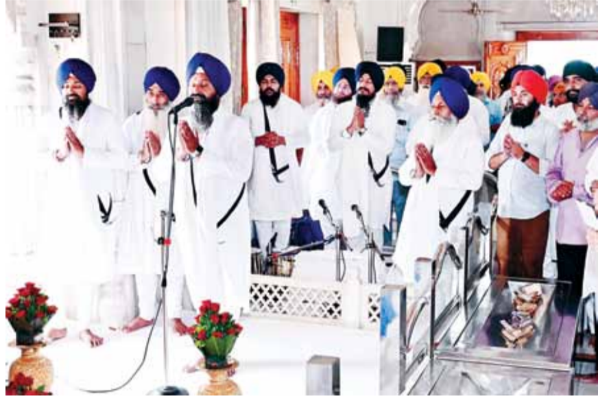
Members of the Sikh community take part in a prayer meet known as Ardas to remember the victims of 1947 partition and to pay tributes at the Akal Takht, Sikhs highest temporal seat, inside Sri Harmandir Sahib complex on Wednesday. Around 10 lakh Punjab men, women and children were killed during the Partition of Punjab between India and Pakistan in 1947.