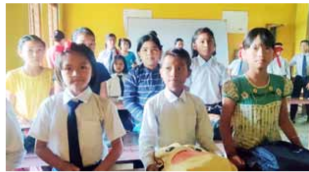
In the school, students spanning from grades 1 to 5 are grouped together in a single classroom, where they receive instruction from the only available primary teacher dedicated to their education.

In an environment once characterized by nature's serenades, the school's surroundings are now marred by the disturbing cacophony of gunshots, blasts, and sirens. The violence engulfing Manipur has left an indelible mark on the psyches of these students. As multiple schools in areas like Kangchup and Singda, including Little Seed and Smart-stalk, have fallen victim to the fiery wrath of mobs, Phayeng High School has witnessed an influx of students. Its location, within a predominantly Meitei region, has provided a semblance