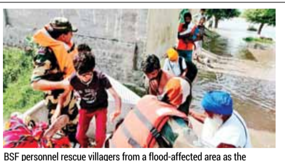
BSF personnel rescue villagers from a flood-affected area as the swollen Beas river inundated nearby areas following heavy monsoon rains, near Ferozepur district of Punjab on Friday.