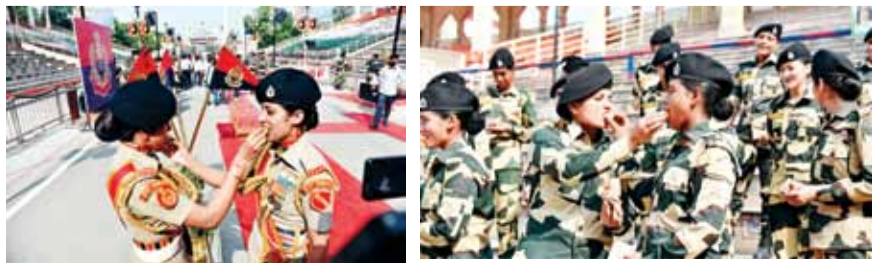
Border Security Force (BSF) personnel exchange sweets during a ceremony to celebrate Indian Independence Day at the India-Pakistan joint border check post of Attari-Wagah border, about 35 kilometers (22 miles) from Amritsar on August 15.