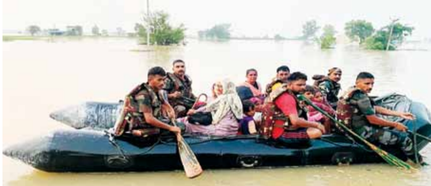
Indian army personnel rescue Residents shift to a safer place from a flood-affected area as the swollen Beas river inundated nearby areas following heavy monsoon rains, near Kapurthala district, some 60kms north-west of Jalandhar on Friday.