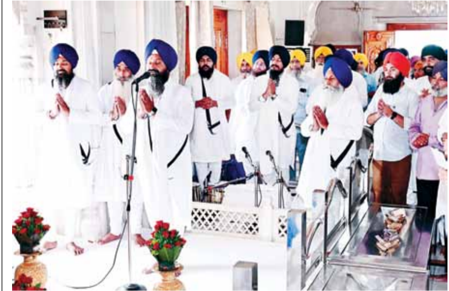
Members of the Sikh community take part in a prayer meet known as Ardas to remember the victims of 1947 partition and to pay tributes at the Akal Takht, Sikhs highest temporal seat, inside Sri Harmandir Sahib complex on Wednesday. Around 10 lakh Punjabi men, women and children were killed during the Partition of Punjab between India and Pakistan in 1947.