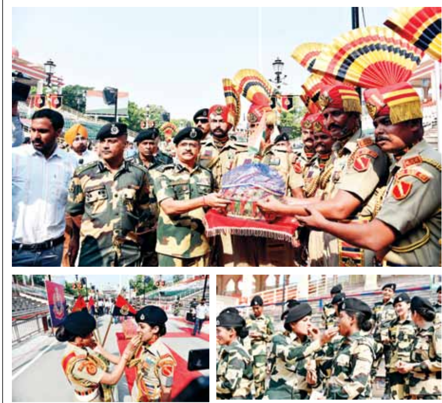
Border Security Force (BSF) personnel exchange sweets during a ceremony to celebrate Indian Independence Day at the India-Pakistan joint border check post of Attari-Wagah border, about 35 kilometers (22 miles) from Amritsar on August 15.