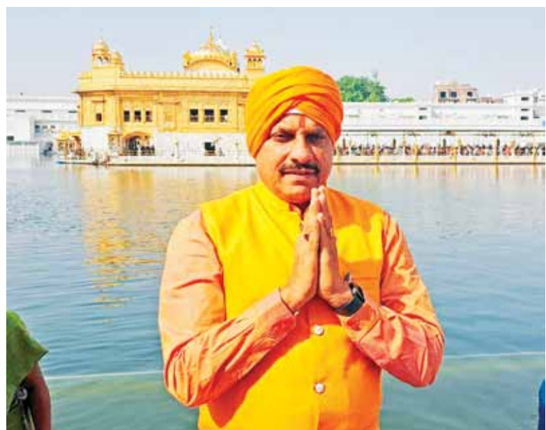
Madhya Pradesh Chief Minister Mohan Yadav offers prayers during his visit to Sri Harmandir Sahib (Golden Temple), on Thursday.