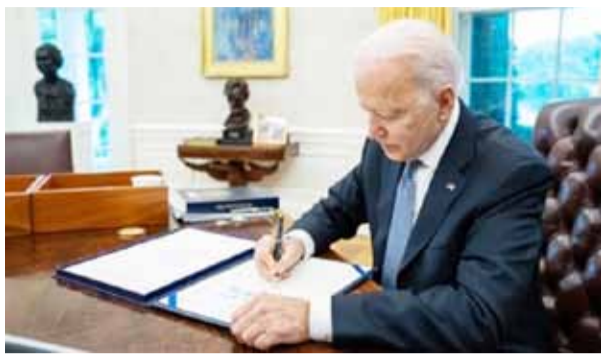
a press call.

Given that the daily encounters are already above the threshold now, the order could take effect right after being signed, empowering border officers to repatriate migrants within "days, if not hours," the officials told reporters during