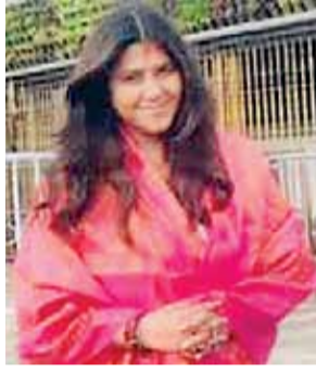
msg everyone back soonest!! thanku for d love'. Actress Kareena Kapoor

Ektaa, who is the managing director and creative head of Balaji Telefilms Ltd, took to Instagram, and shared a video, which showcases glimpses of her posing in a white suit at the temple. There is also a snippet of the birthday girl cutting a chocolate cake. The post is captioned, 'Venkatramana Govinda! will