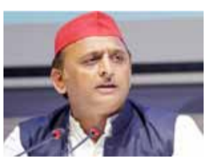
was a must to unravel the truth," he added.

"Such frequent paper leaks raise concerns if it were a part of a deeper conspiracy to destabilise India's human resource and cause law and order situation. A court-monitored probe