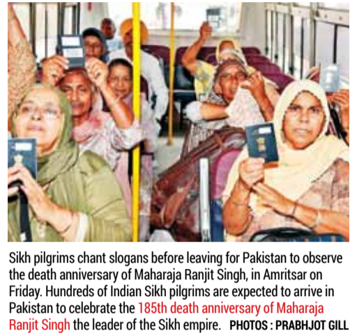
Sikh pilgrims chant slogans before leaving for Pakistan to observe the death anniversary of Maharaja Ranjit Singh, in Amritsar on Friday. Hundreds of Indian Sikh pilgrims are expected to arrive in Pakistan to celebrate the 185th death anniversary of Maharaja Ranjit Singh the leader of the Sikh empire.