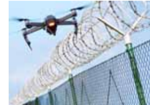
Punjab, said that in 2023 it detected and shot down 107 drones and seized 442.395 kg of heroin.

The BSF, responsible for safeguarding the 553-km long varied, tough and challenging India-Pakistan border in