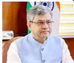
states are also bad this year, according to experts.

It should be noted that the farmers of North India have been demanding to increase this support price for a long time. They even went on the road to protest to fulfill this demand. Even at the beginning of this year, the national politics was once again agitated by the peasant revolt. Farmers staged sit-in protests at several borders of Delhi. But no decision has been taken in this regard till now by the BJP government. As a result, the results of the BJP in these