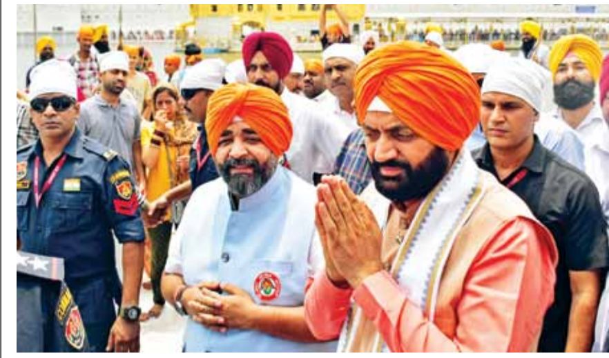
Haryana's Chief Minister Nayab Singh Saini pays respect at Dri Harimandir Sahib (Golden temple) on Friday.