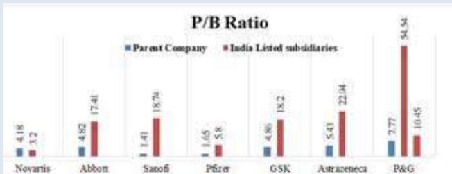
Source: Comparative analysis of P/B Ratio of Parent MNC and its Indian subsidiaries