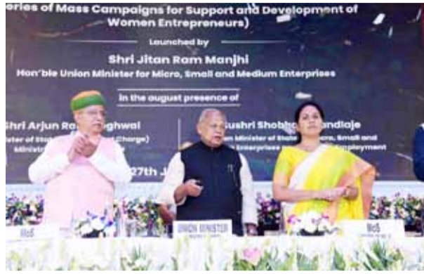
The event brought together key stakeholders from various sectors, including policymakers, large corporations, financial institutions, and members of the international community.

NEW DELHI: The Ministry of Micro, Small, and Medium Enterprises (MoMSME) observed 'Udyami Bharat - MSME Day' today, with Union Minister for MSMEs, Jitan Ram Manjhi, presiding over the event.