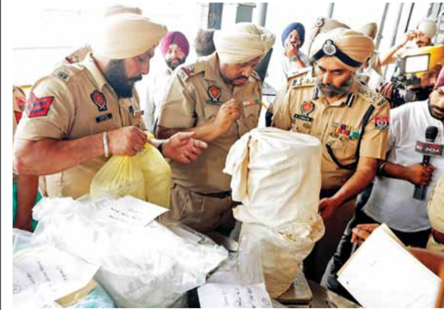
Police personnel inspect illegal drugs at a paper mill in Amritsar on Wednesday on the occasion of International Day against Drug Abuse and Illicit Trafficking.