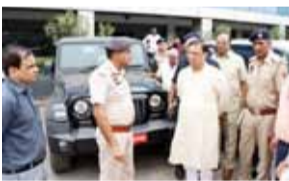
Hisar