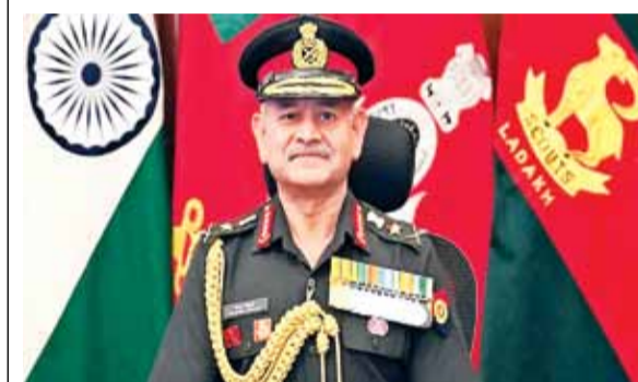
General Upendra Dwivedi, the newly appointed Chief of Army Staff.

"Every loose end or thread that we left hanging has to be wrapped up. Obviously, the most important thing will be the face-off between these three, which will be between Yaskin, who can now wield the Gandiva, which is thought to be the most powerful weapon, versus Karna and Ashwatthama, who are the most fearsome warriors," he added.