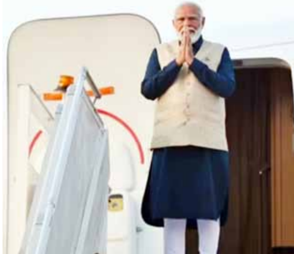
in 41 years.

He will thereafter travel to Austria on July 9 which will be the first visit by an Indian Prime Minister to the country