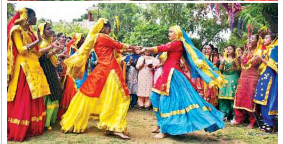
College girls perform 'giddha', a popular folk dance to celebrate the Hindu festival of Teej at Shahzada Nand college in Amritsar on Tuesday.