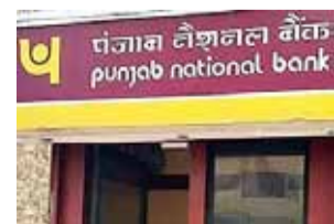
Exterior view of a Punjab National Bank branch in Patna.

The district police are currently investigating the incident. The criminals also took away the Digital Video Recorder (DVR) of the bank's CCTV system, which