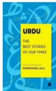
Urdu: The Best Stories of Our Times Edited by Rakhshanda Jalil; Harper Perennial; 200 pages; Rs 399.

The stories in this anthology are not only reflective of the socio-political environment but also delve into the psychological impacts of these external conflicts. For instance, Hyder's The Halfway View not only presents a love triangle but also subtly comments on the complexities of human relationships in a rapidly changing world. Similarly, Prakash's Scarecrow is not just about exploitation but also about the resilience of the human spirit in the face of systemic failures. Jalil's editorial choice to focus on