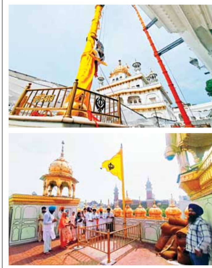
A Sikh volunteer ties a Nishan Sahib flag, Sikh religious flag on a pole in front of the Akal Takht in the Sri Harmandir Sahib (Golden Temple complex), on Friday. Akal Takht, the highest temporal body of the Sikhs, has issued a circular asking Gurdwaras across the state to ensure that the colour of the Nishan Sahib is either Basanti (xanthic) or surmai (blue).