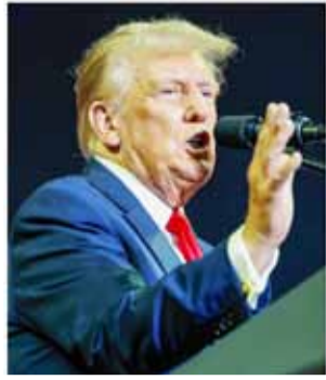
by CBS News.

Trump, 78, and President Joe Biden had agreed in May to two presidential debates. The first which was with CNN took place in June while a second one slated for September 10 was planned to be hosted by ABC News. But Biden dropped out in the previous month and therefore, Vice-President Harris is the declared presidential candidate for 2024 in the Democratic Party. The assessment was published before Saturday, when Trump said he had agreed to an offer by Fox News to debate Harris on September 4, in what would be a departure from the planned format if reported