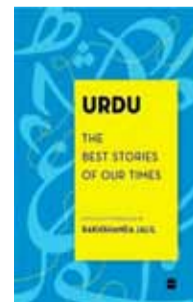
Urdu: The Best Stories of Our Times Edited by Rakhshanda Jalil; Harper Perennial; 200 pages; Rs 399.

The stories in this anthology are not only reflective of the socio-political environment but also delve into the psychological impacts of these external conflicts. For instance, Hyder's The Halfway View not only presents a love triangle but also subtly comments on the complexities of human relationships in a rapidly changing world. Similarly, Prakash's Scarecrow is not just about exploitation but also about the resilience of the human spirit in the face of systemic failures. Jalil's editorial choice to focus on