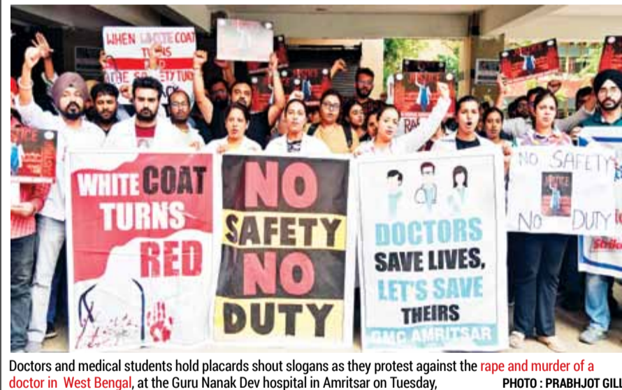
Doctors and medical students hold placards shout slogans as they protest against the rape and murder of a doctor in West Bengal, at the Guru Nanak Dev hospital in Amritsar on Tuesday.