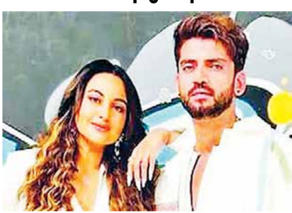
caption. This is not the first time Sonakshi has expressed love to Zaheer. Earlier this week, the actress took to her Instagram stories, where she shared

"Home is where the heart is... and wherever in the world... my heart is with my home - @iamzahero," she wrote as the