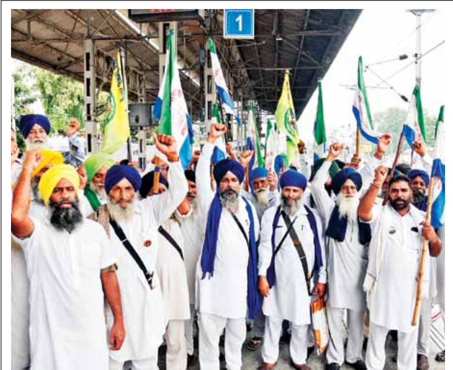
Farmers shout slogans during a protest to demand minimum crop prices, before departing for the Haryana-Punjab state border in Shambhu, from a railway station in Amritsar on Tuesday.

SONAM KAPOOR flaunts her 'minimal, bold and effortlessly on point' look