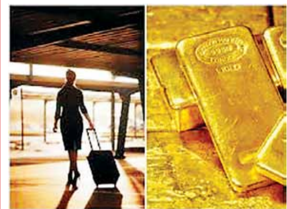
Lady passengers from Pakistan intercepted with Gold handles fitted with utensils with silver colour coating