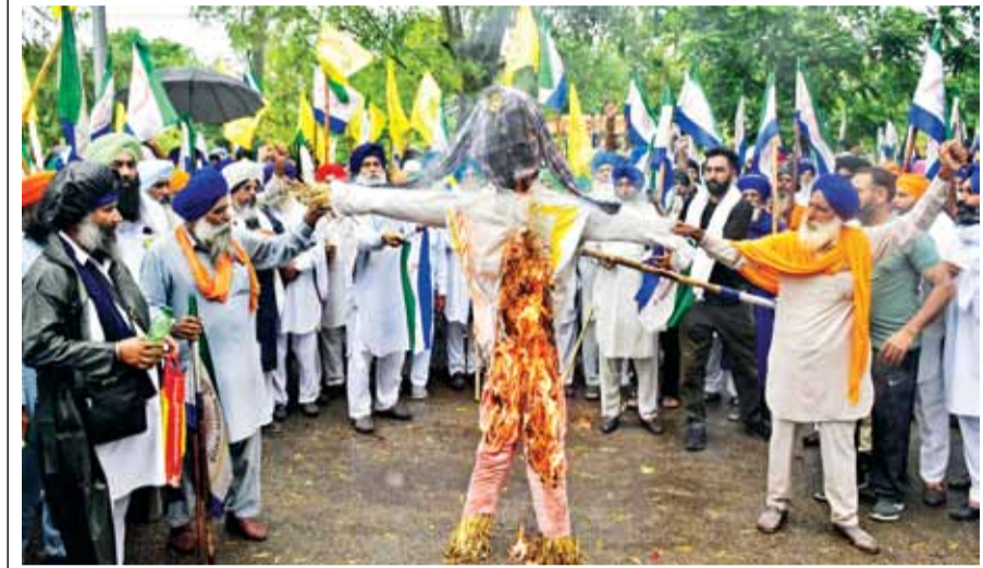
Farmers shout slogans as they burn an effigy of India's Prime Minister Narendra Modi during a protest against the central government demanding minimum crop prices, in Amritsar on Thursday.