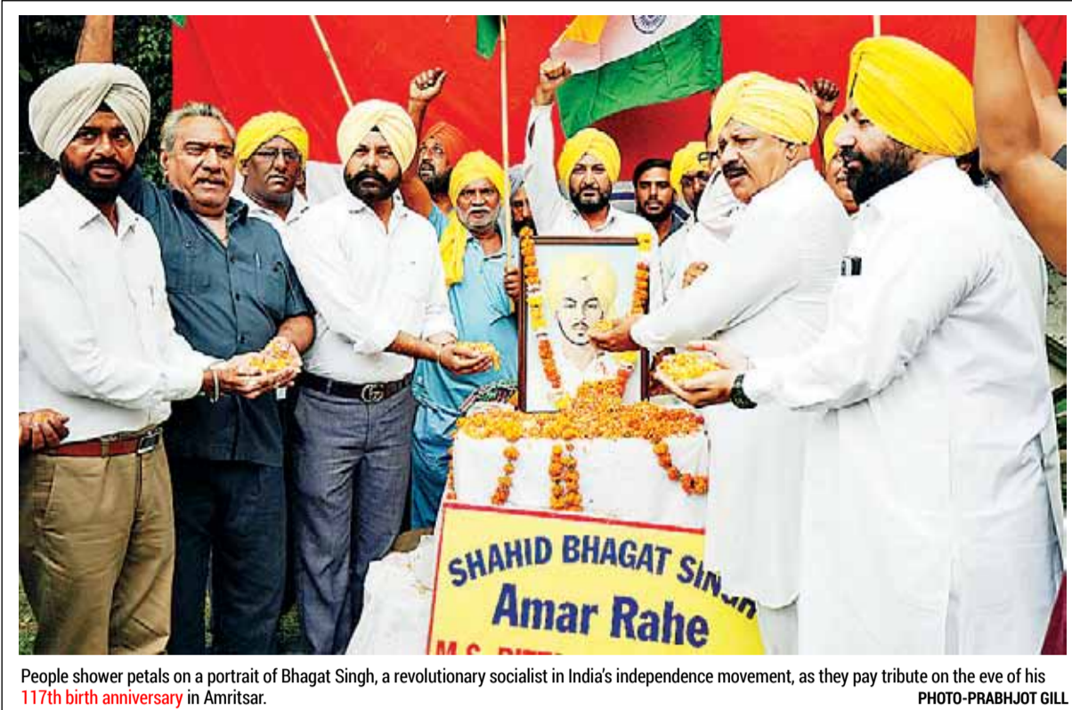
People shower petals on a portrait of Bhagat Singh, a revolutionary socialist in India's independence movement, as they pay tribute on the eve of his 117th birth anniversary in Amritsar.

Apart from that, Alia will also be seen in Shiv Rawail's directorial titled 'Alpha' alongside 'Munhya' fame actor Sharvari Wagh. 'Alpha' is the first female-based espionage thriller in the 'YRF Spy Universe'. The project has been bankrolled by Aditya Chopra under the banner of Yash Raj Films. Meanwhile, Alia made her debut as the lead in 2012, with Karan Johar's teen film 'Student of the Year', alongside debutants Sidharth Malhotra, and Varun Dhawan. She has then appeared in movies like-- 'Highway', 'Humpty Sharma Ki Dulhania', 'Udda Punjab', 'Badrinath Ki Dulhania', 'Raazi', 'Gully Boy', 'Gangubai Kathiawadi', 'RRR', 'Brahmastra: Part One - Shiva', and 'Rocky Aur Rani Kii Prem Kahaani'.