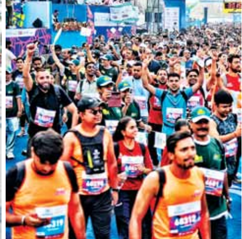
A photojournalist during coverage '19th Vedanta Delhi Half Marathon 2024' in New Delhi on Oct 20, 2024