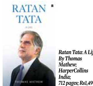
Ratan Tata: A Life By Thomas Mathew HarperCollins India 712 pages; Rs1,499

The biography also addresses Tata's thoughts on Noel Tata, his half-brother, as a potential successor. Ratan believed Noel needed more exposure to challenging assignments to