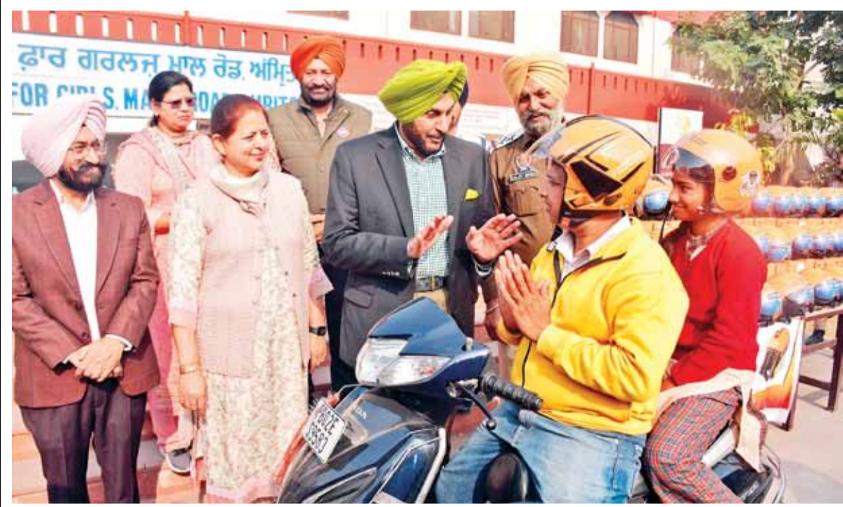
Punjab police personnel distribute helmets to schoolgirls during a road safety campaign at a government school in Amritsar on Wednesday. Schoolgirls hold helmets distributed by Punjab police personnel during a road safety campaign at a government school in Amritsar on Wednesday. Schoolgirls wear helmets distributed by Punjab police personnel during a road safety campaign at a government school in Amritsar on Wednesday.