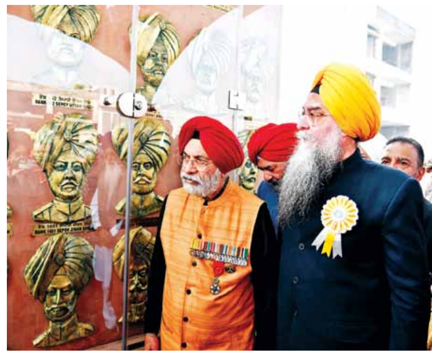
Indian Army's Sikh Regiment personnel lay wreaths as they pay tributes on the Saragarhi Monuments at the Golden Gate on the outskirts of Amritsar on Thursday. The Saragarhi Foundation has established Saragarhi Monuments to honor the extraordinary bravery of the 21 Sikh soldiers who fought and gave their lives against Afghan tribesmen 127 years ago.