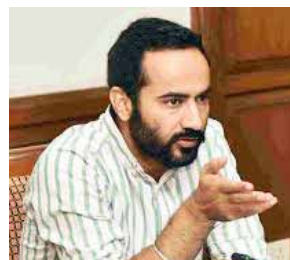
ciding to go in for the centralization of the university but owing to the fierce opposition of the Chief Minister Bhagwant Singh Mann led Punjab Government the Union Government had to step back. A resolution was also passed in the Punjab Vidhan Sabha against the centralization of the Panjab University. Meet Hayer further divulged

CHANDIGARH: The Member of Parliament from Sangrur Mr. Gurmeet Singh Meet Hayer has lashed out at the Union Government for indulging in a conspiracy of the most heinous nature to destroy the Panjab University, Chandigarh and said that this would not be taken lying down and struggle would be waged tooth and nail on every front to keep its status intact. The MP has written a letter to the Vice Chancellor Jagdeep Dhanakar, who is also the Chancellor of the university, with regard to conducting elections to the Senate of the institution. He mentioned that earlier too, the Union Government tried a devious ploy to snatch away the university from Punjab by de-