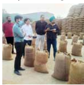
Food and Supply Controller

KARNAL: In a major alleged fraud in procurement and fraudulent gate passes, officials detected around 4,000 quintals of paddy missing from stock allocated to a Karnal rice mill for custom-milling rice (CMR) for 2024-25 season due to irregularity in the paddy procurement process. Following the discovery, the District