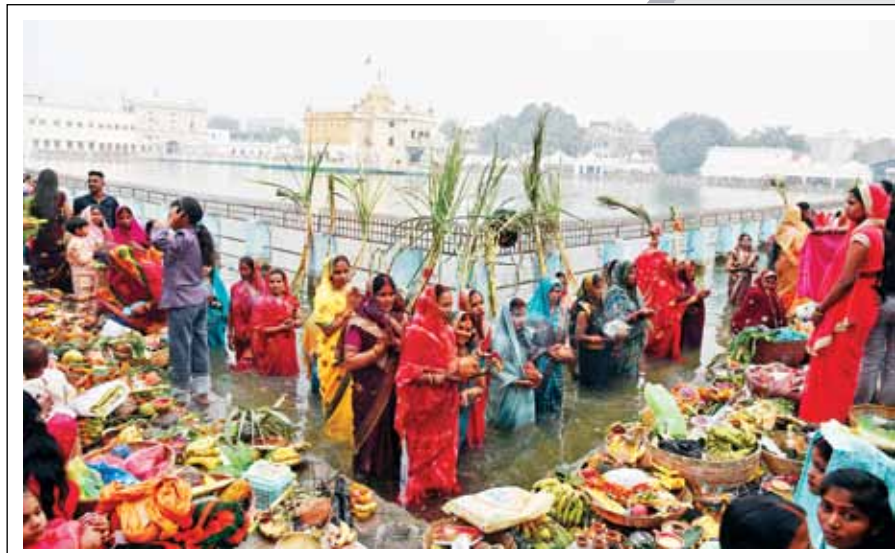
Hindu devotees offer prayers to Sun God on the occasion of the Hindu festival of 'Chhath Puja' at Durgiana temple in Amritsar on Thursday.

He acknowledged presence of his audience sitting at roofs of their houses and said from the stage - I would also like to thank those who are enjoying this show for free by sitting on the roofs from a distance. This is a very special occasion for me. I am getting love from all sides.