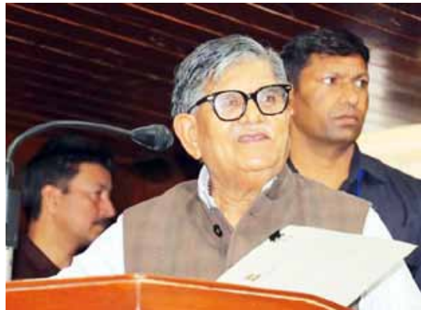
release pending compensation for lands affected by the barbed wire. The Governor pledged to provide better educational

Governor of Punjab Gulab Chand Kataria emphasized the crucial role of border villages in protecting the country during his visit to village Kakkar falling in the Amritsar district. He acknowledged the challenges faced by residents and vowed to address their concerns in collaboration with the central and state governments. Governor Kataria promised to ease farming across barbed wire borders, ensuring CCTV cameras and anti-drone systems are installed for enhanced security. He assured farmers to