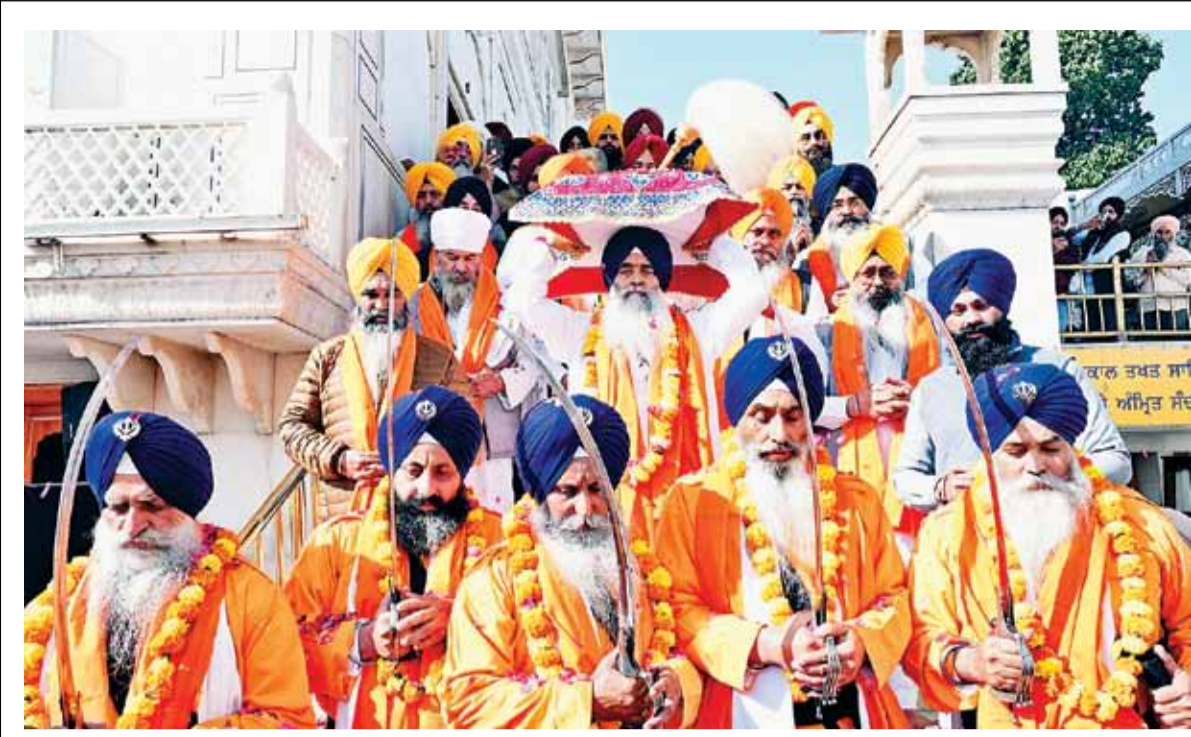
An Sikh priest carries the Guru Granth Sahib (Sikh holy book) during a religious procession on the eve of Sikh Guru Tegh Bahadur's martyrdom day, at Sri Darbar Sahib on Thursday.