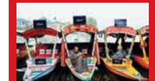
FW DESK Srinagar

Uber has introduced a water transport service on the famous Dal Lake in Srinagar, Jammu & Kashmir, enabling tourists and locals to book rides on the region's iconic shikaras through its app. This marks Uber's first water transport venture in India, joining similar services it operates in cities like London. Travelers can reserve rides on the traditional wooden boats, known for their vibrant canopies and intricate decorations, at least 12 hours and up to 15 days in advance. Dal Lake is home to around 4,000 shikaras, which have long been a staple for both local commuters and tourism. While Uber will facilitate bookings, it will not charge a fee, ensuring that operators receive the full fare paid by passengers. The move has received mixed reactions from shikara operators. Wali Mohammad Bhatt, president of the Shikara Owners Association, welcomed the development, highlighting fixed pricing and convenience for customers as key benefits. However, some operators were skeptical, believing it would have little impact on their established customer base. Srinagar's Dal Lake, surrounded by houseboats and the Himalayas, remains one of Kashmir's most prominent attractions, and Uber's new service may further boost the region's recovering tourism industry.