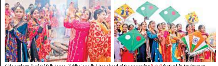
Girls perform Punjabi folk dance 'Giddha' and fly kites ahead of the upcoming 'Lohri' festival, in Amritsar on Friday, January 10, 2025.