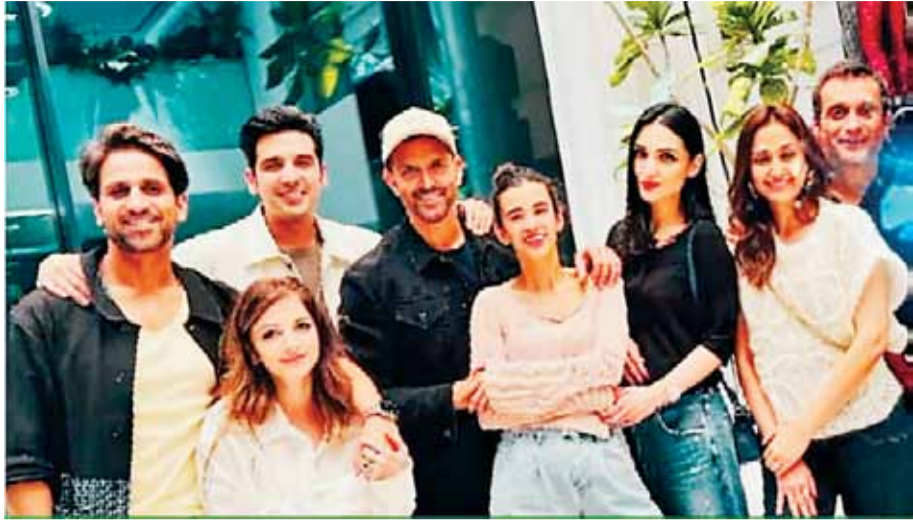
Hrithik and Sussanne were childhood sweethearts. They got married in 2000 and 14 years later they separated. The duo share two sons together.

MUMBAI: As Bollywood's Greek God Hrithik Roshan turned 51 on Friday, his former brother-in-law Zayed Khan shared a picture from the celebrations which included his ex-wife Sussanne Khan and his ladylove Saba Azaad among many others. Zayed took to his Instagram, where he wished the