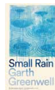
Small Rain By Garth Greenwell; Picador, 320 pages; Rs 750.

a backdrop of multi-layered brokenness—physical, emotional, and societal. The narrator resides in a damaged house with his partner, in a country fracturing under the weight of the pandemic and racial tensions. Beyond these personal and national struggles lies a world devastated by climate change, where even the natural order is collapsing with the disappearance of bird species. This intricate layering of brokenness reflects the interconnected fragility of human existence and the planet.