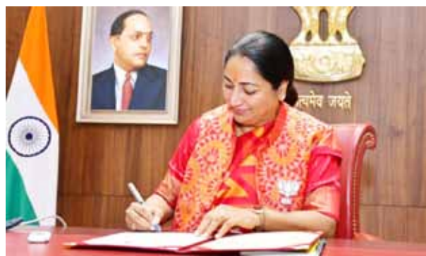
Chief Minister and Ministers.

NEW DELHI: The BJP's new government in Delhi led by Rekha Gupta has relieved from duties all officials or employees who were deployed by the previous AAP government in diverted capacity in the offices of Chief Minister and Ministers and sent them back to their respective departments, said an official on Friday.