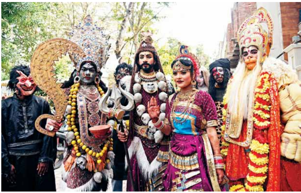
An artist dressed in the guise of Lord Shiva along with Hindu devotees take part in a religious procession on the occasion of Maha Shivratri festival, in Amritsar on Wednesday, February 26, 2025.