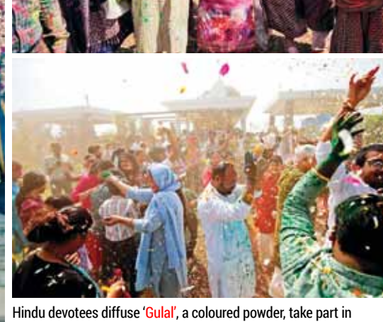
celebrations of the Holi celebrations, the Hindu spring festival of